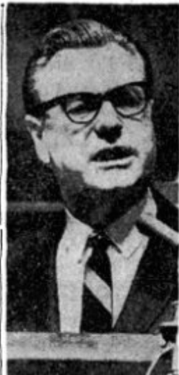
DELIVERING MESSAGE: Governor Rockefeller as he spoke before the Legislature.