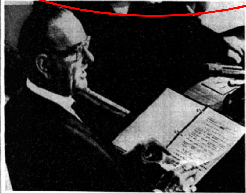
APPRAISING THE STATE OF THE UNION: President Johnson speaking to Congress