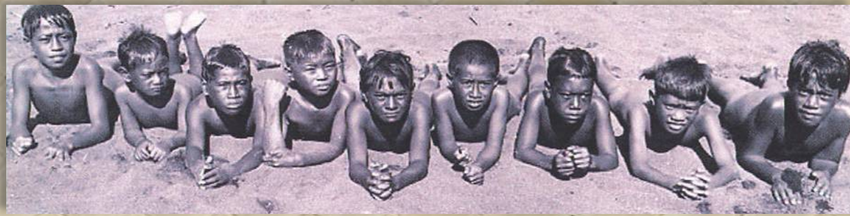
Waimea, Kaua`i, circa 1850